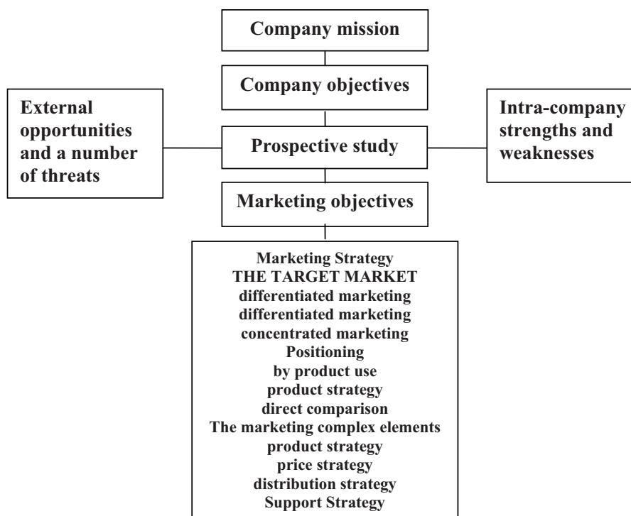
Figure 2. Strategic marketing planning process (drawn with reference to Virvilaitė, 2008)

nated among themselves and with all the company's activities. According to Pranulis (2008), particularly the business planning enables one to connect and harmonize the various parts into a coherent whole, thereby achieving a better overall result. The definition of marketing planning could be such: the marketing targets, product selection, market segmentation and marketing programs for each product's development for the next period. This definition is sufficiently broad and includes strategic and tactical marketing planning. Different authors provide different structures of marketing plan. These structures are what is marketed is the area of application of the marketing plan, i.e. services or production. This paper will deal with the most popular marketing plan structure and carried out comparative analysis. According to Pranulis (2008), the general strategic plan covers the entire organization's performance and provides a primary goal. Since they are sought by various divisions within the company, it is necessary to move from general company objectives and overall strategy to strategies for each functional area (finance, marketing, production, etc.). These can be further detailed in accordance with each area of activities. This reveals the consistency of a typical marketing planning scheme that is given in Figure 2.