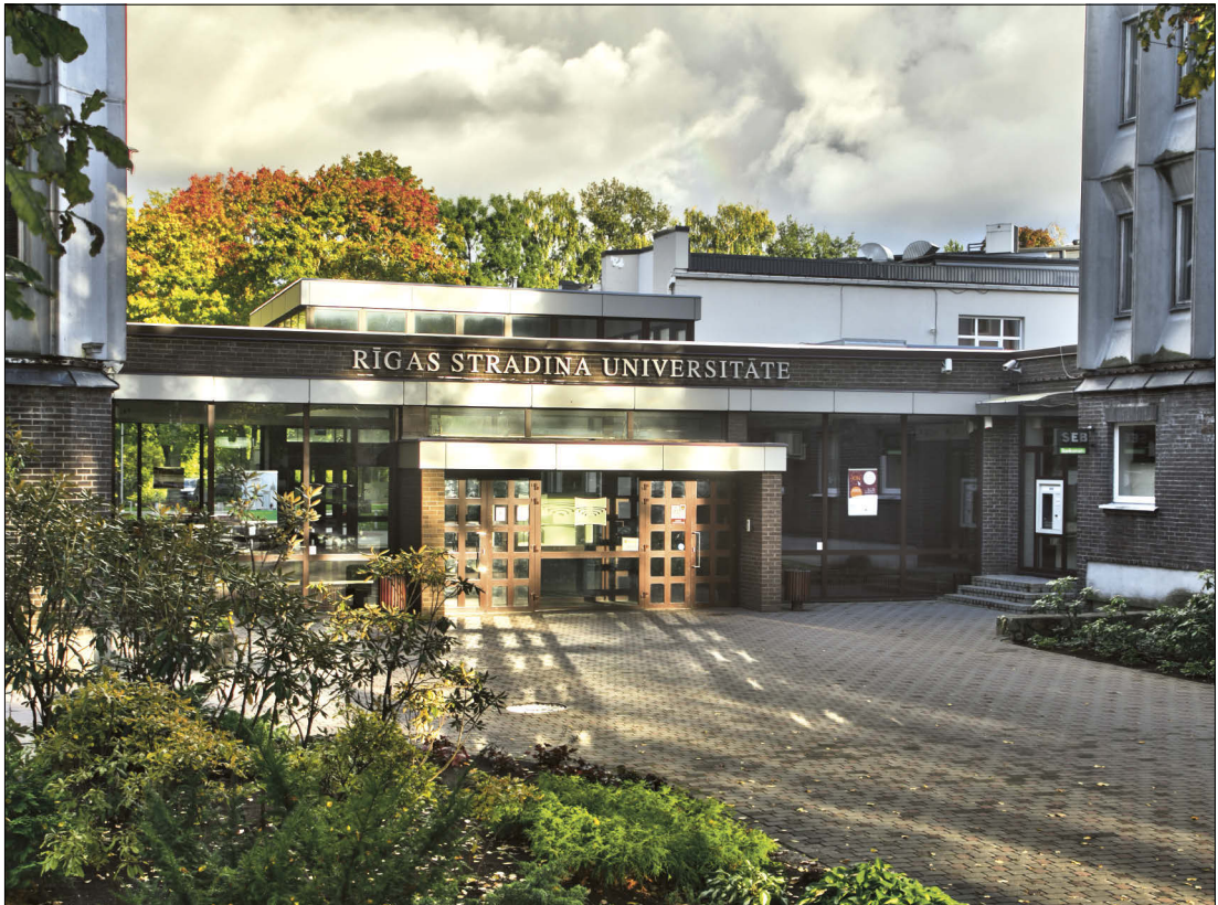
RĪGA STRADIŅŠ UNIVERSITY