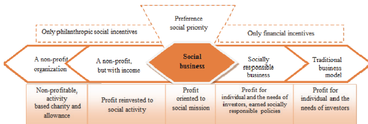
Figure 1. The range of social business model